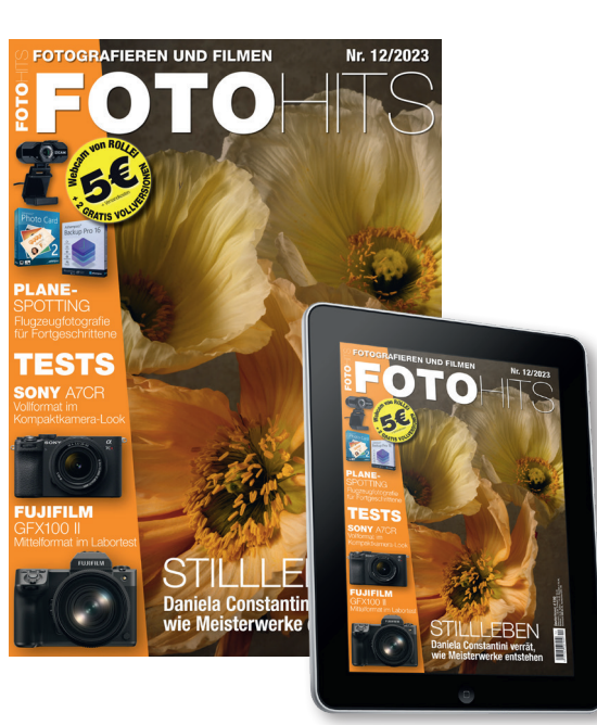
FOTO HITS Magazine ranks among the leading periodicals on the semipro and professional german photo market. For this reason, FOTO HITS' focal points are premium products and challenging but practical photographic topics for better imaging results.

FOTO HITS offers the entire bandwidth of modern media solutions. The ePaper version is available not only for Apple's iPad, but also for Android tablets, PCs and smartphones.