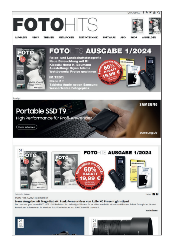
FOTO HITS.DE is a highly efficient platform for your online advertising campaigns – with 275.000 page impressions and 57.000 unique visitors per month at the maximum. Delivery to desktop devices: 55%, mobile devices: 45%

If you don't have online advertising material, please don't hesitate to ask us. We will develop it for you: fast, reliable and at a fair price.